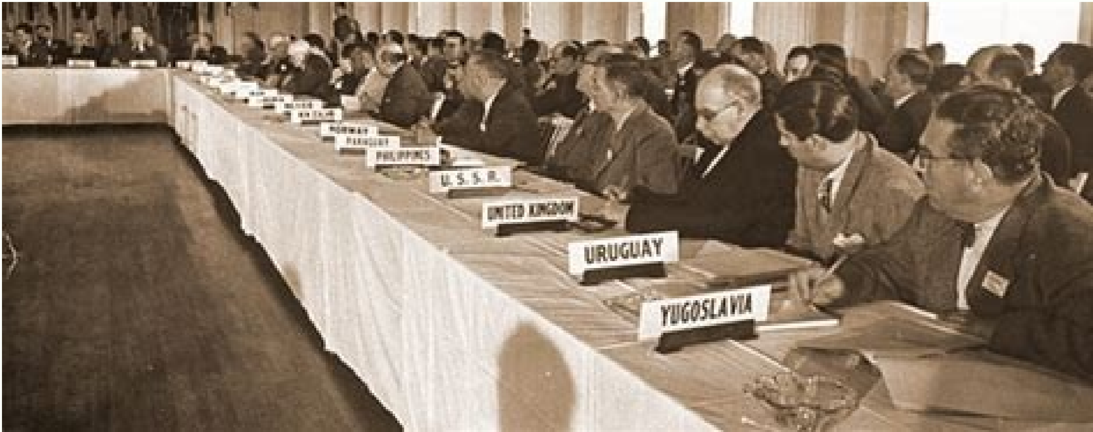
Bretton woods conference 1944 participants. What were the outcomes of the 1944 bretton woods conference. What was the significance of the bretton-woods conference in 1944 quizlet. Which of the following entities was created at the bretton woods conference of 1944. The 1944 bretton woods conference resulted in the formation of the Bretton woods 1944 new hampshire conference. Bretton woods conference 1944 pdf. Bretton woods conference 1944 organisation.