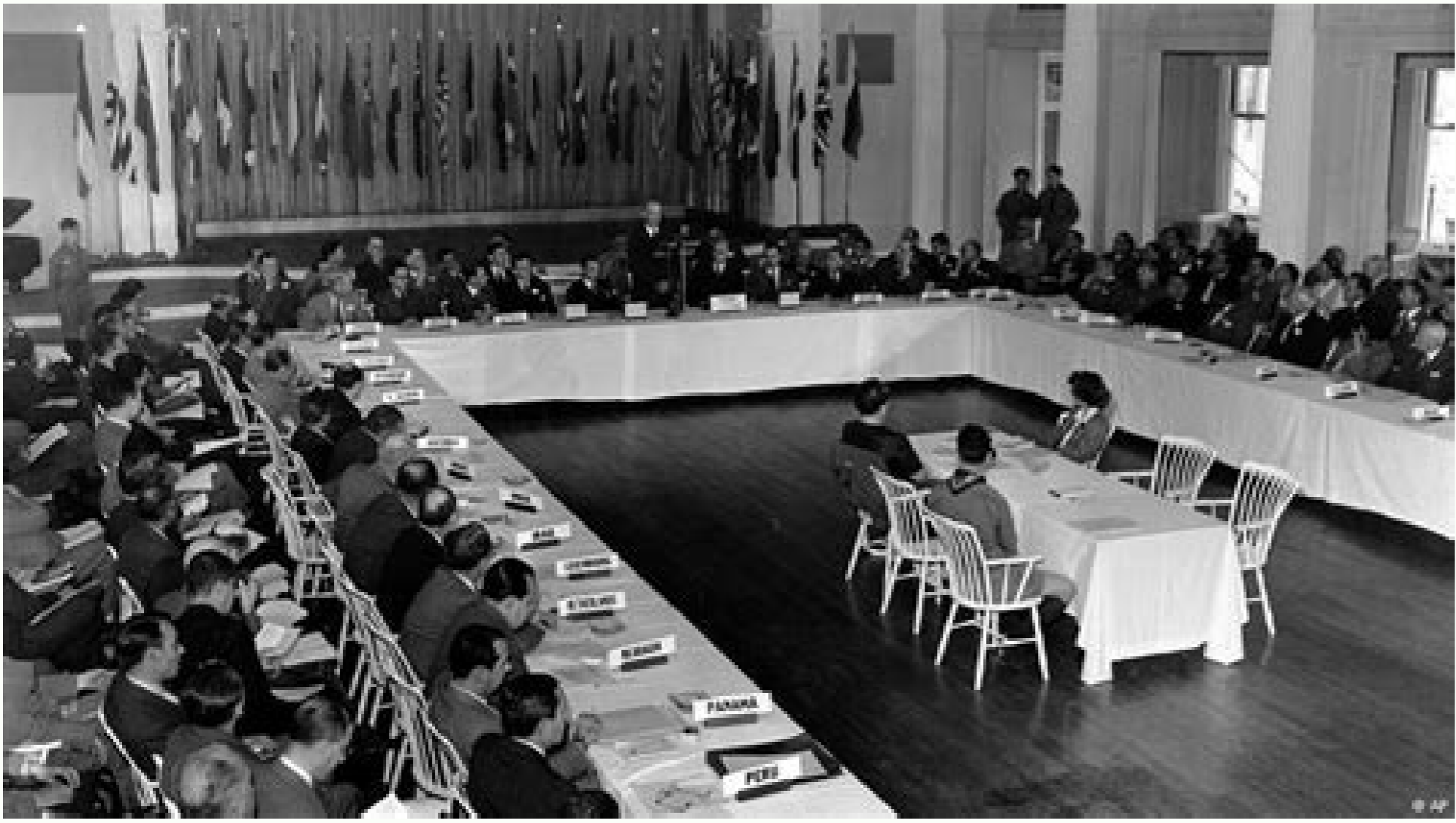
The Bretton Woods Conference was held at the Mount Washington Hotel in Bretton Woods, New Hampshire, in 1944. It was the first time that representatives from all the major world powers met to discuss the future of the world economy. The conference resulted in the creation of the International Monetary Fund (IMF) and the World Bank.